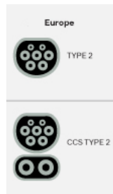
Electric Car Charge Port Options

If you choose to ship an electric car, keep in mind that electric cars in Europe have different charging ports than the US. CCS Type 2 is most common along with the standard Type 2 (see below graphic). You may purchase an adaptor to be able to charge at supercharger locations with DC power.